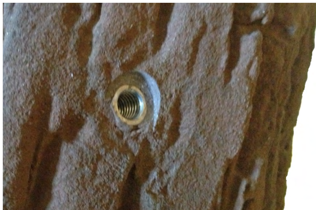
Female Threaded Connection