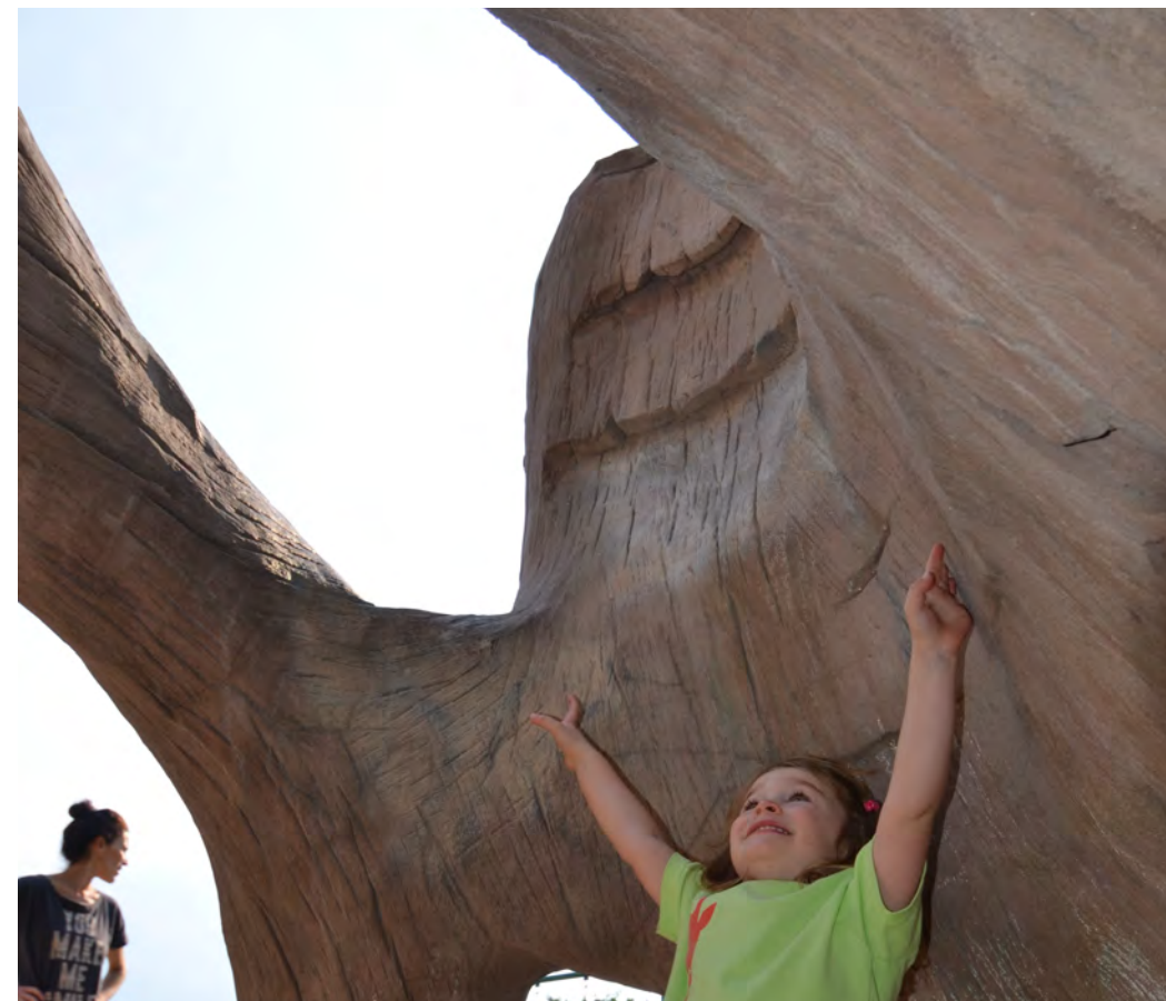
4 Typical Finish