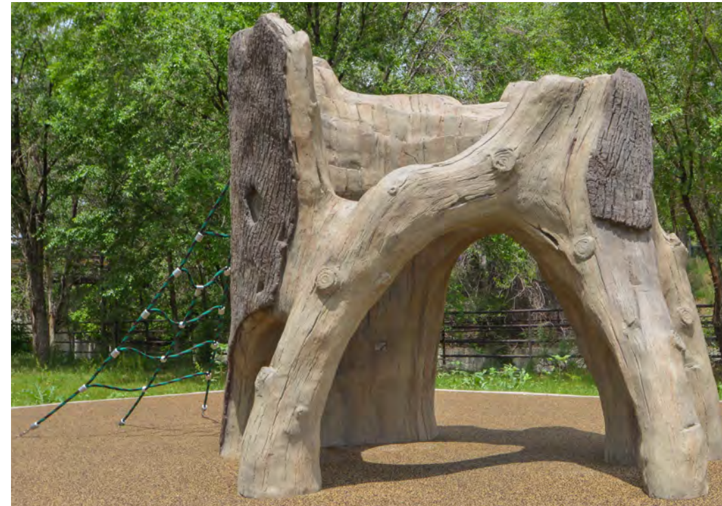
3 Home Tree_AP004