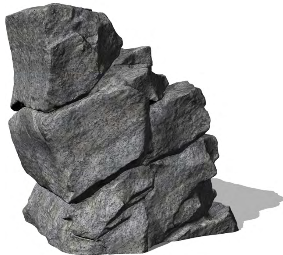
2 Transition Boulder