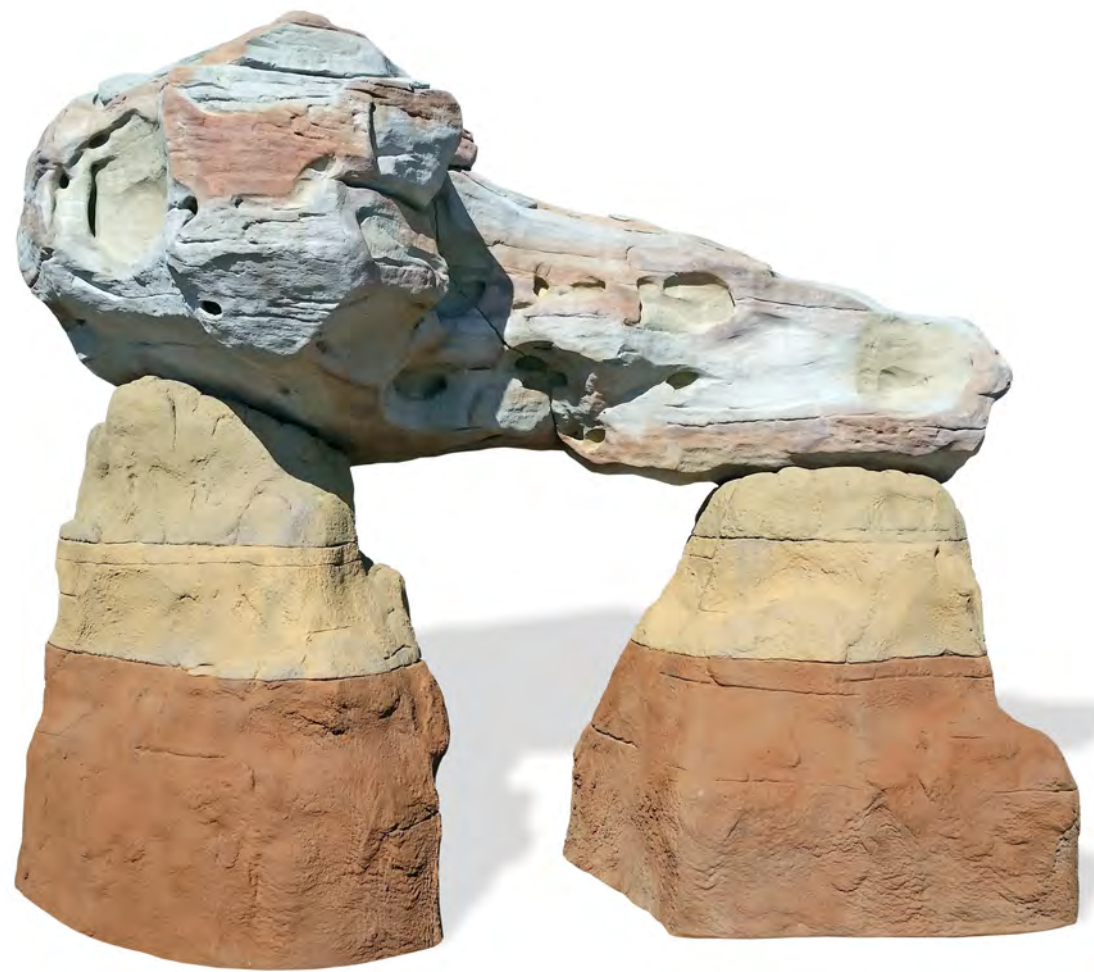
3 HooDoo Arch_CB010