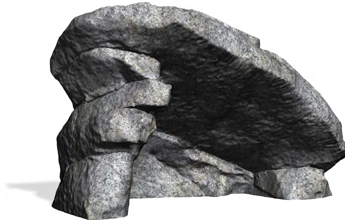
3 Cave Rock_CB011