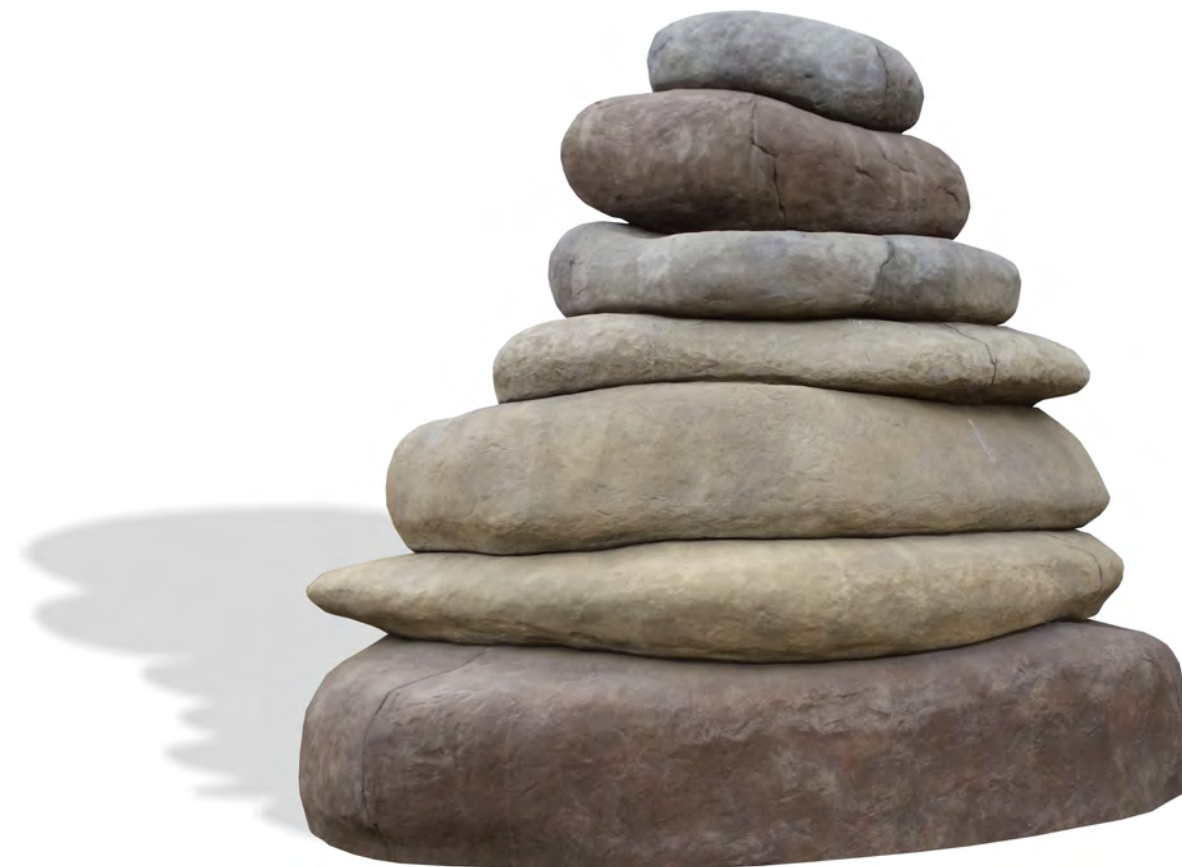
3 Cairn Tower_CB012