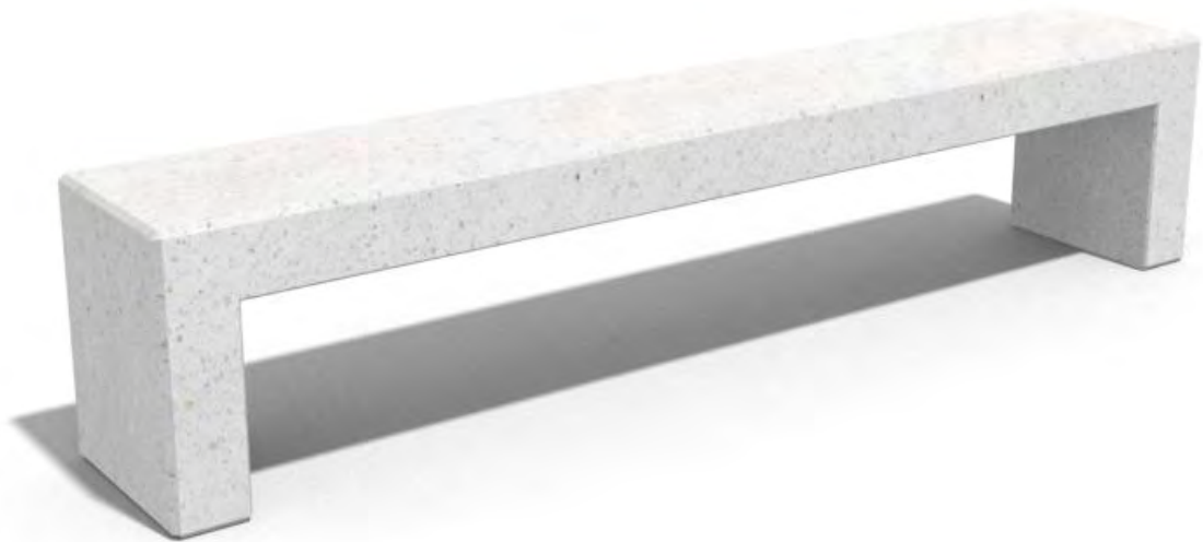
3 Axtel Bench_SF018