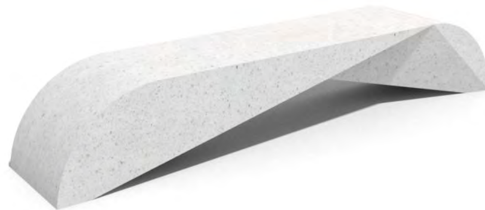
3 Eolus Bench_SF024