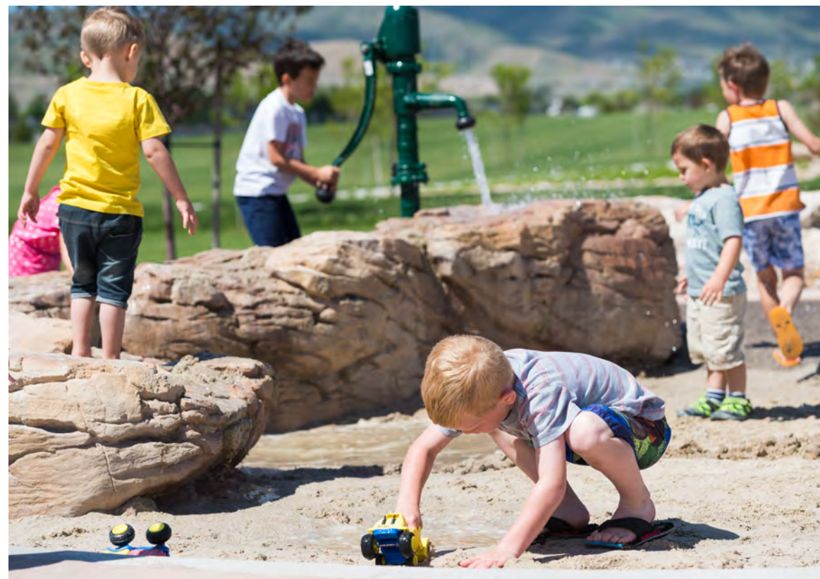
4 Sand Table