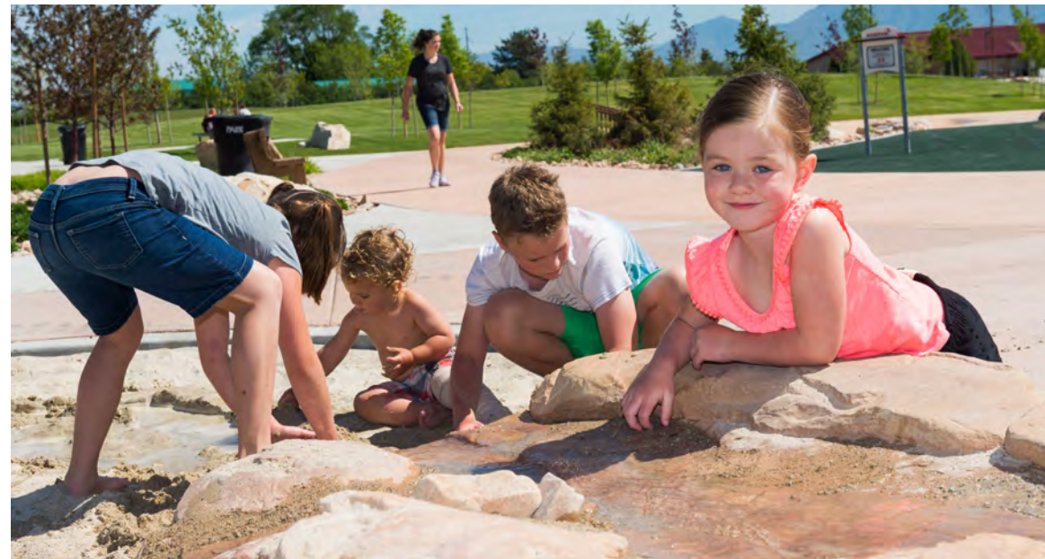
3 Sand Table