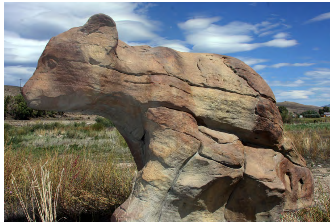
3 Bear Cub