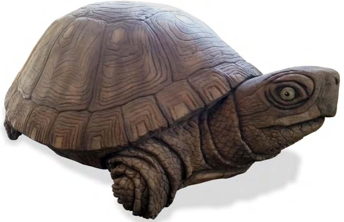
3 Box Turtle_TC028