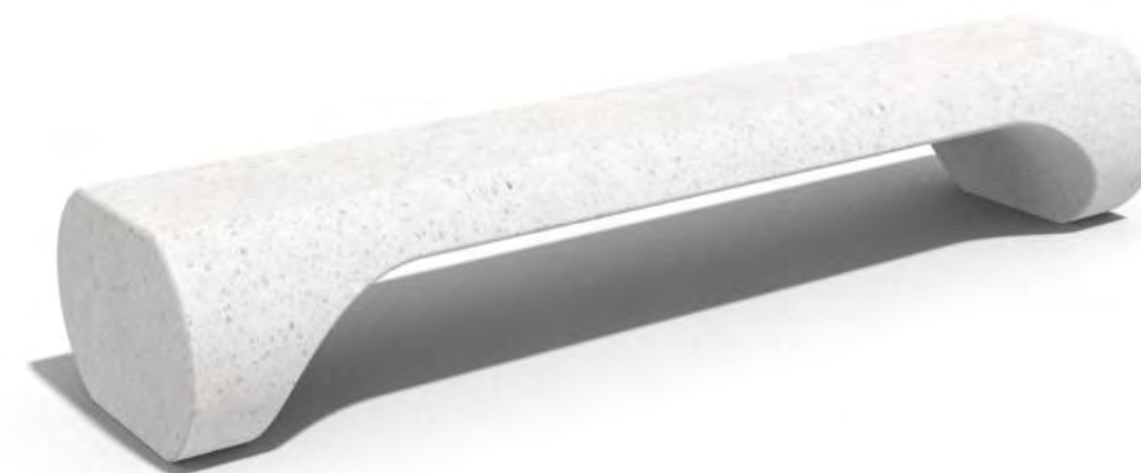
3 Sopris Bench_SF020