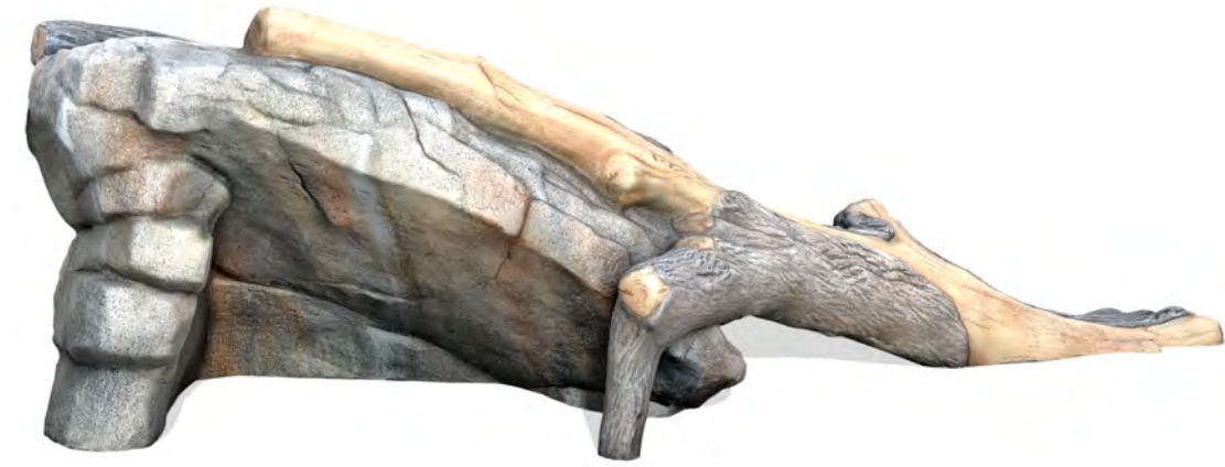
3 Timber!_No Net_ AP011 (Rock Type: Granite)